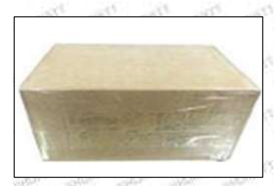
Pic No. 2 Domestic express packaging: Wrapped with Transparent tape

Minors are prohibited from using transparent tape, yellow tape, black wrapping protective film, and white wrapping protective film to avoid personal injury.